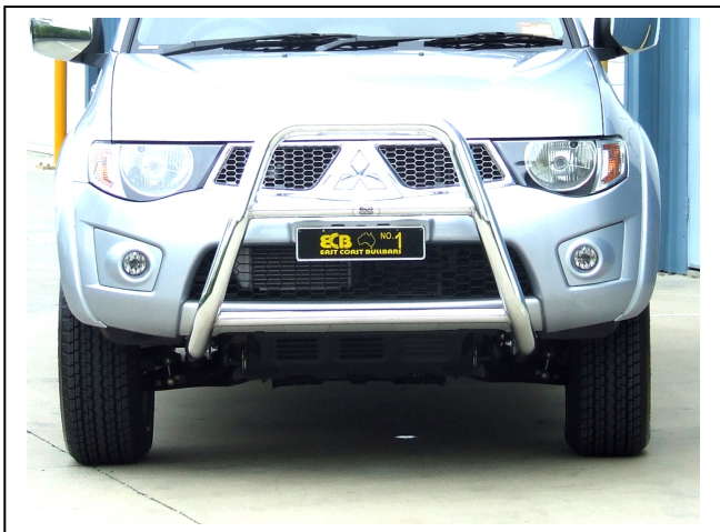
Figure 5 – 63mm Series 2 Nudge Bar Front view shown