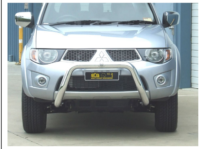
Figure 7 – 76mm Nudge Bar Front view shown