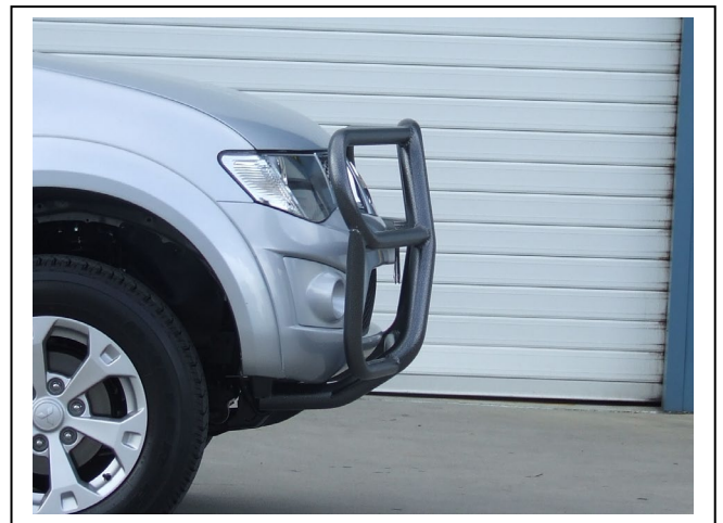
Figure 4 – Type 8 side view shown