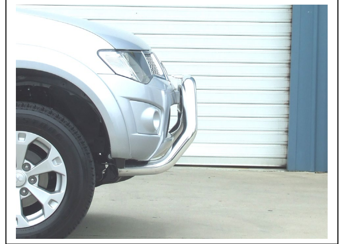
Figure 8 – 76mm Nudge Bar side view shown