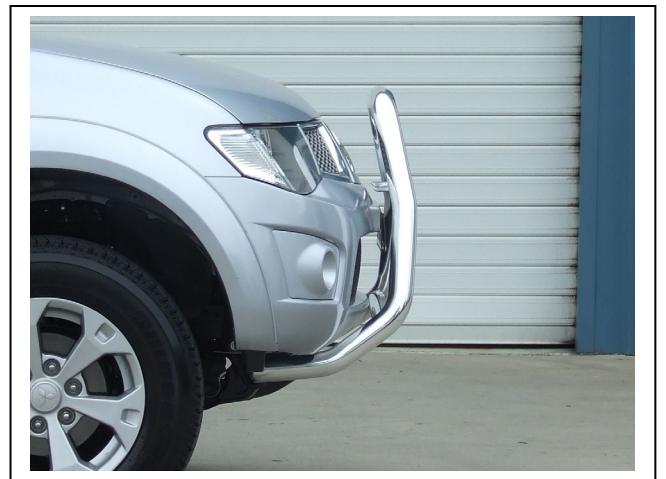
Figure 6 – 63mm Series 2 Nudge Bar side view shown