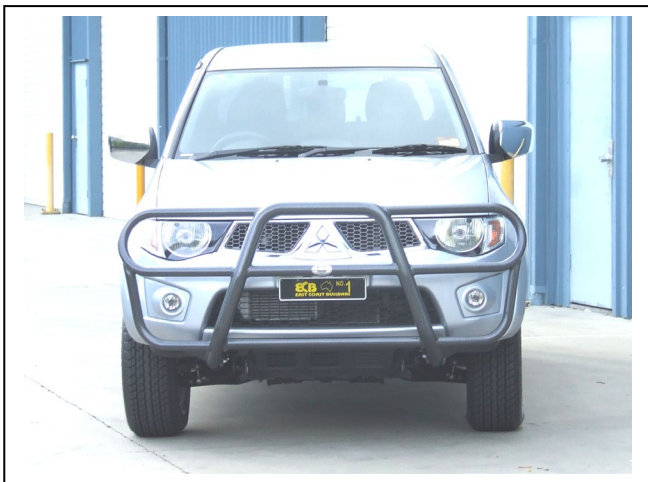
Figure 3 – Type 8 Front view shown